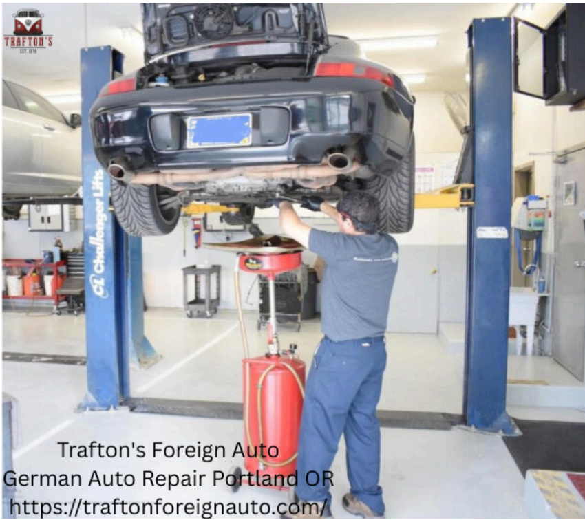
Trafton's Foreign Auto German Auto Repair Portland OR https://traftonforeignauto.com/